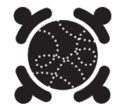
Table Talk Contact the church office with topics you'd like to see included!